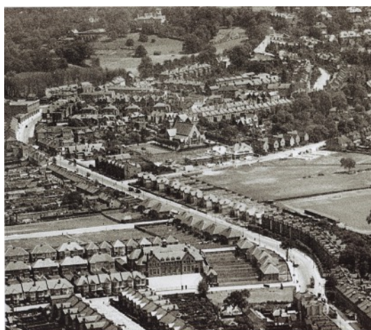
Aerial photo 1922

As this is written we are in the midst of the Global Covid-19 Pandemic, the impact of which is going to be significant over the coming days and years. In the short term it limits the way we can interact with each other and is having a significant impact on people's ability to work. Going forward we will need to remain flexible in the way we apply our Mission Action Plan to the decisions we make.